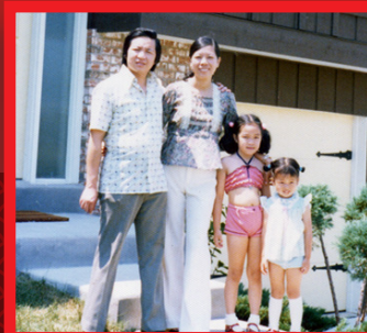
1975 Our family reunited in Mason, Ohio