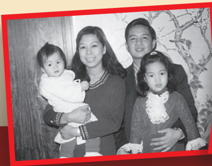
Hong Kong, 1972