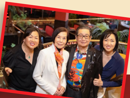
Oriental Wok, 2024