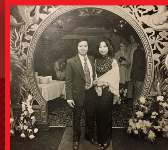
1977 Grand Opening Oriental Wok Edgewood, KY